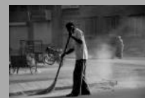
Raising Dust: Encounters In Relational Geography