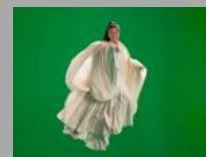
ISAAC JULIEN/Creative Caribbean Network